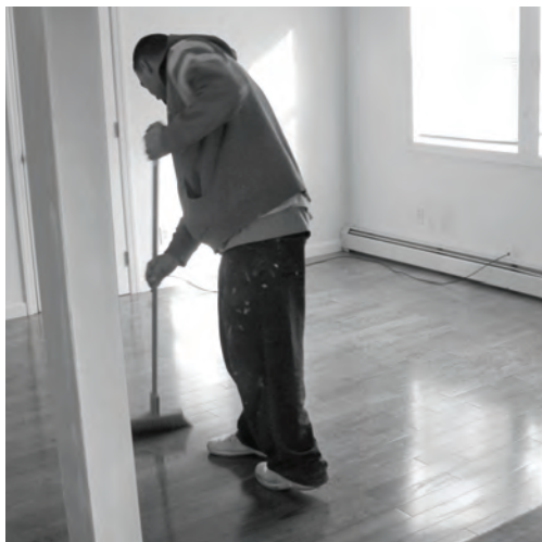
To help out a married couple with health issues, Major Homes remodeled a room, free of charge.

"He's beyond fantastic. It was a miracle."