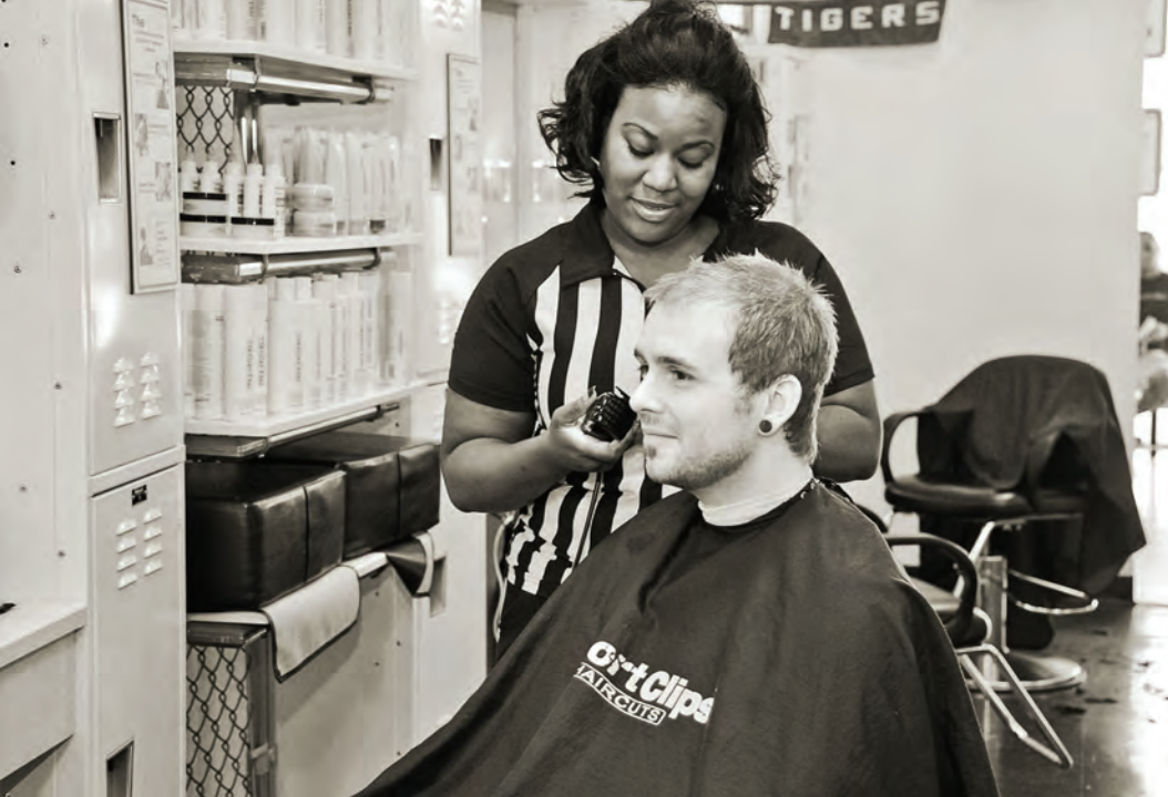
A Sport Clips customer gets his hair cut, with donations going to make hair booms for the Gulf Coast region.

absorbed more oil and less water than hair, which could also cause debris.