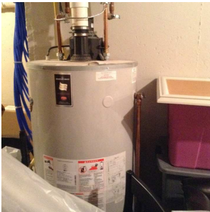
Water Heater 04/11/2014 12:57 PM