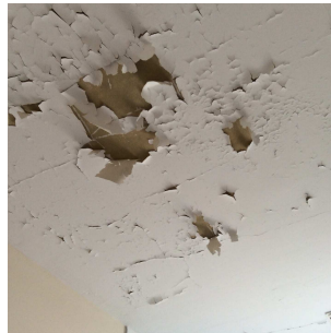
Bathrooms (2/2) 04/09/2014 6:21 PM