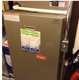
Furnace 04/11/2014 12:57 PM