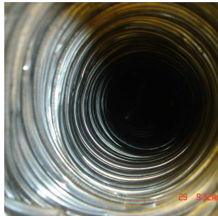
Dryer and Dryer Vent (2/2) 04/22/2014 12:19 PM