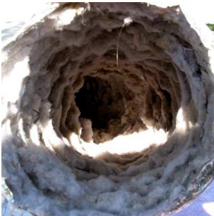
Dryer and Dryer Vent (1/2) 04/22/2014 12:19 PM